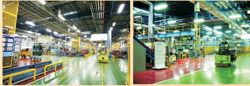
Hankook Kumsan Plant in Korea