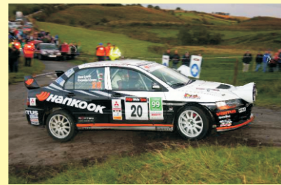
BRITISH RALLY CHAMPIONSHIP