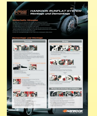
HRS (Hankook Runflat System) Tyres