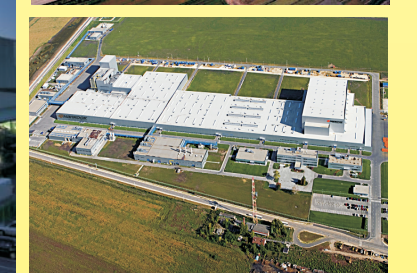
Kumsan(top left), Daejeon (bottom left) plants in Korea, Jiaxing(top right) in China, Dunaujvaros (bottom left) in Hungary

If you have a chance to visit the Hankook Head Office or factories in Korea (2), China (2), Hungary (1) or their Research and Development centres, other facilities and operations over the world, you will be very surprised at their grand size, state of the art facilities and efficient operations – that's is to say nothing of their leading technology. When I was working for Hankook, I met a great deal of tyre dealers who had many experiences visiting tyre factories and facilities in the world including the 'big 6' and many others. Their first words to me were always like this;