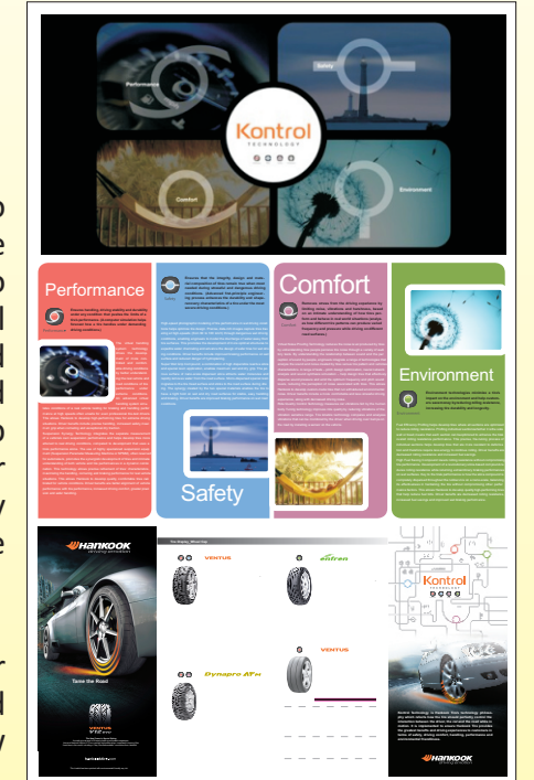
Hankook Kontrol Technology

This provides not only better comfort, performance and safety but ensure less rolling resistance which leads to lower fuel consumption and less CO2 emissions. This will also lead to Hankook getting more opportunities to work with the major car manufacturers.