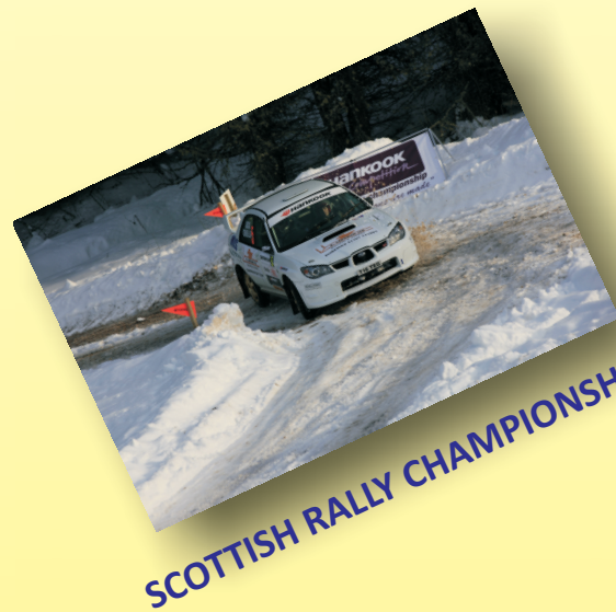
SCOTTISH RALLY CHAMPIONSHIP