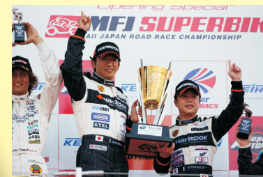
JAPAN SUPER GT