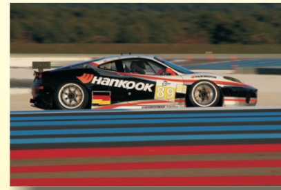
LE MANS 24hr