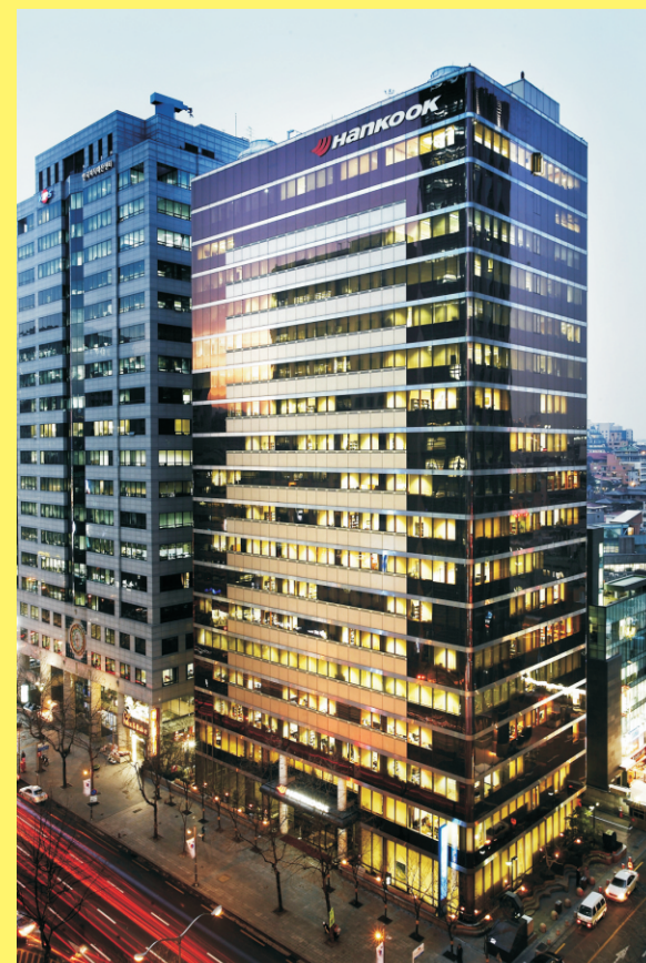
Hankook Global Head Office - Seoul Korea

Can you believe there are more than 200 tyre brands (not manufacturers) in the U.K market? It is a funny industry indeed. It looks like almost every country on Earth produces tyres! But tyres are such important and technology-driven products - not just black rubber. They are incredibly important to our safety on the road.