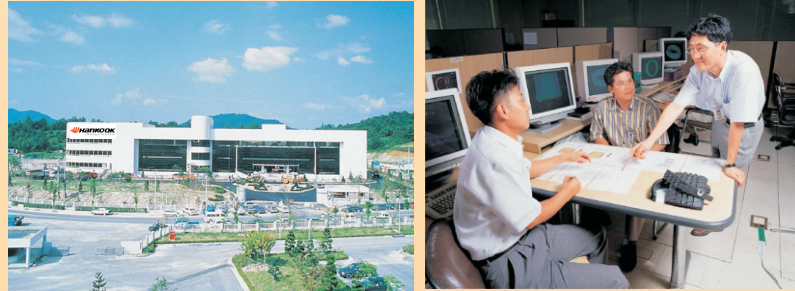
Hankook Global R&D Centre in Korea

Hankook's global operations and business are rapidly increasing and expanding, making the 'big 6' nervous as they lose their market share. Some of them have even made offers to Hankook to buy their brands ! Some have offered to work with Hankook.