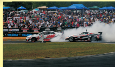
ATLANTA FORMULA DRIFT

Hankook has been working very hard to increase their Brand Awareness in the past decades. This includes a great deal of investment in marketing activities around the world. Hankook racing teams are all over the world;