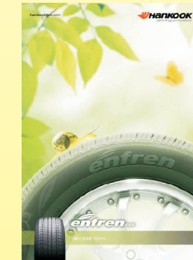
Environment Friendly Tyres